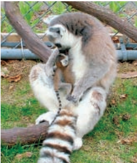
The ring-tailed lemurs remain one of the Game Farm's most popular exotic animal exhibits.

Last spring, the LONG ISLAND GAME FARM was fortunate enough to acquire two new pairs of exotic mammals from other continents.