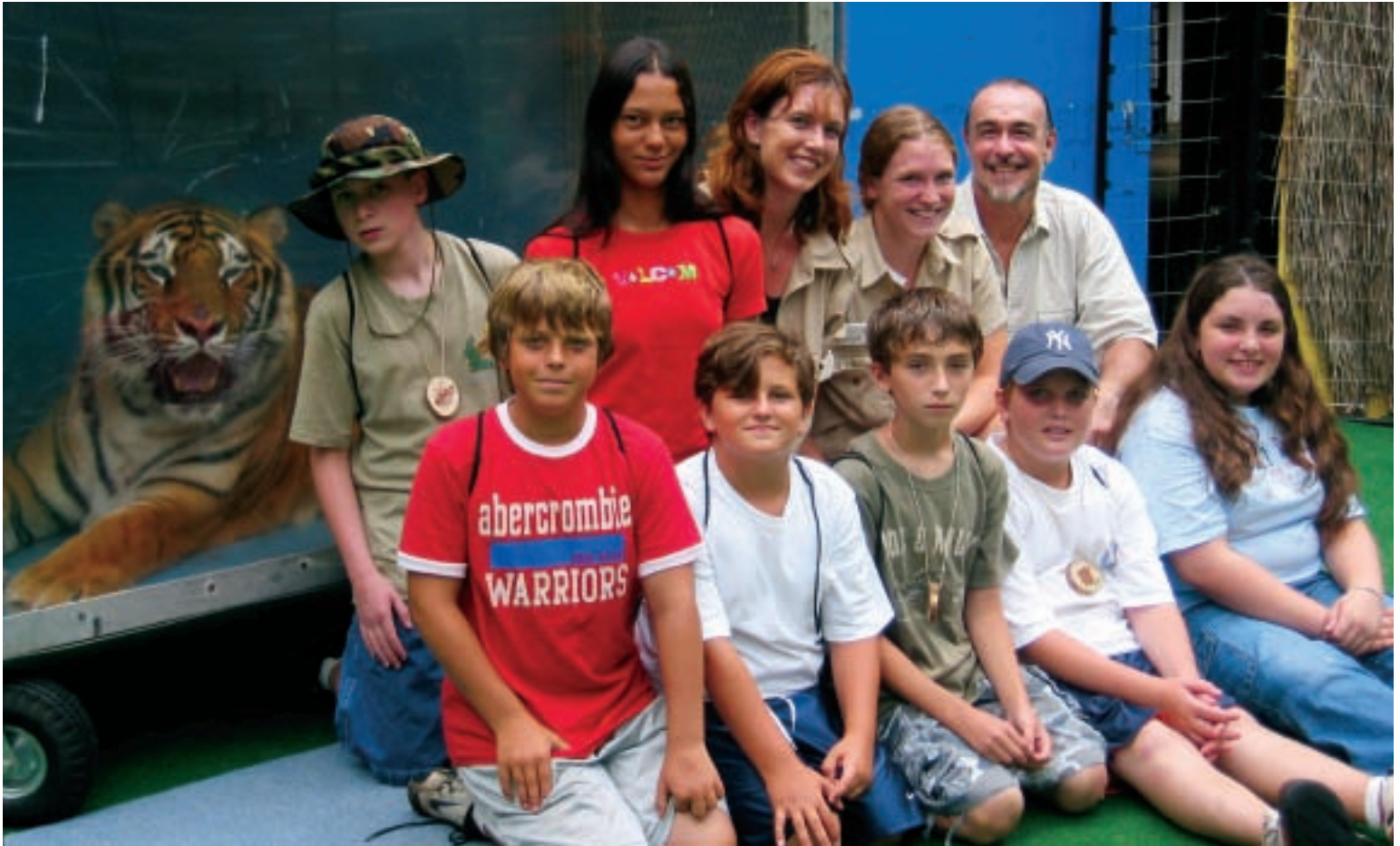
ABOVE: Campers visit with tigers during the Long Island Game Farm's Camp Zoo. BELOW: Younger campers learn and have fun.

Summer on Long Island brings all kinds of things: summer vacation, ice-cream trucks, and Camp Zoo at the LONG ISLAND GAME FARM! Camp Zoo offers a week-long day camp for children ages 4-11 with weekly sessions from July 10 to August 4. The program offers kids a rich fun-filled learning environment that promises to be the highlight of the season.