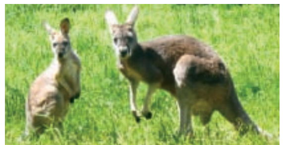
TOP: Kinkajous, Pomegranate and Tangerine. ABOVE: Red Kangaroos, Jackson and Sheila.